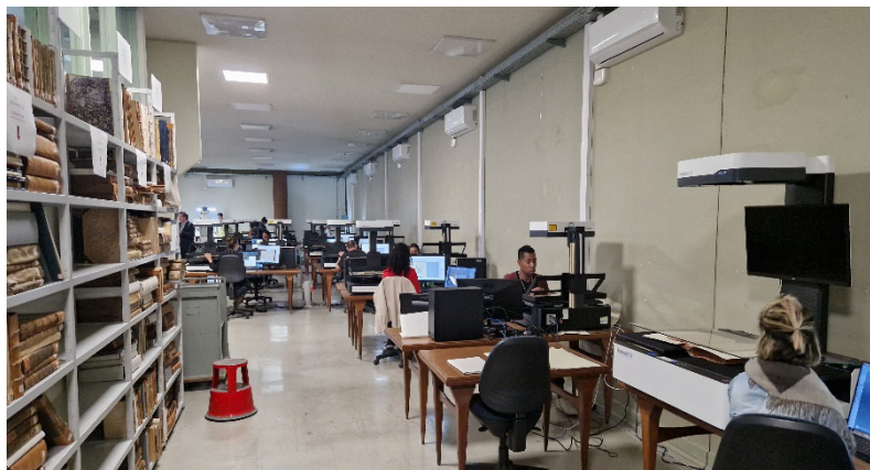
More than 20 Bookeye® Scanners (Bookeye 5 V2 Archive & Bookeye 5 V1A) are used to realize the project at the Biblioteca Nacional de Portugal!

A major challenge was protecting the fragile and aging documents during the digitisation process. To address this, non-invasive planetary scanners were utilised along with careful handling techniques. Ensuring consistent image quality and accurate OCR for documents with varying legibility required meticulous calibration and quality control. To meet these demands, the project deployed advanced scanning equipment from Image Access, including the Bookeye 5 V2 Archive + Flat Glass and Bookeye 5 V1, supported by Dyanix's technical expertise. These solutions were designed to follow best practices in digital preservation, ensuring that the digitised materials would be accessible worldwide through the National