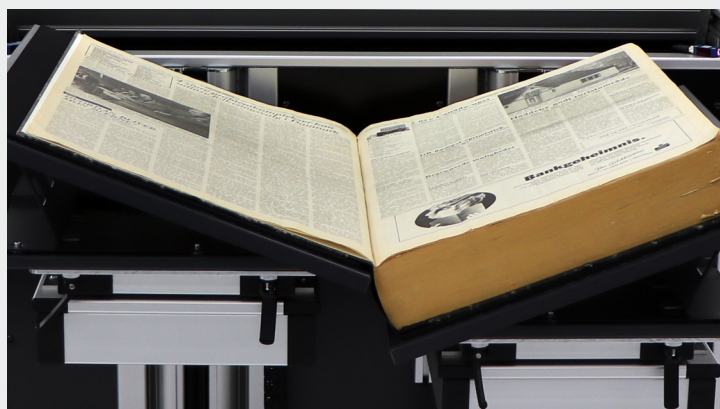
Scanning a book using the protective V cradle for fragile bound documents.

Together with software packages such as Batch Scan Wizard, BCS-2® and Goobi UCC, even the toughest requirements of a digitization project can be met.