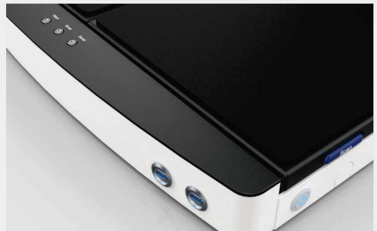
Store images directly to any USB devices via the USB 3.0 ports