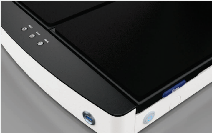
Store images directly to any USB devices via the USB 3.0 port