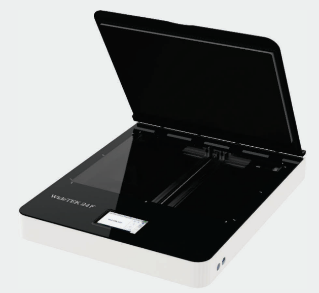
Scratch resistant glass plate enables scanning oversized originals