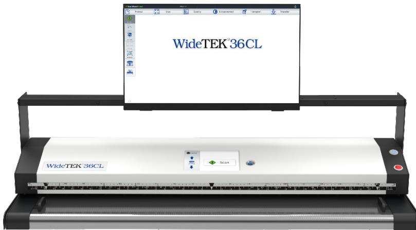
Touchscreen on a WT36CL mounted at center position