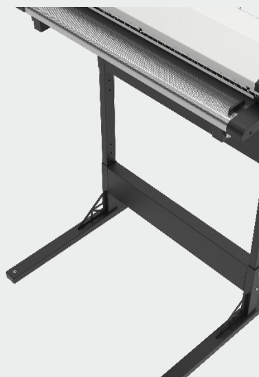
Adjustable stand included