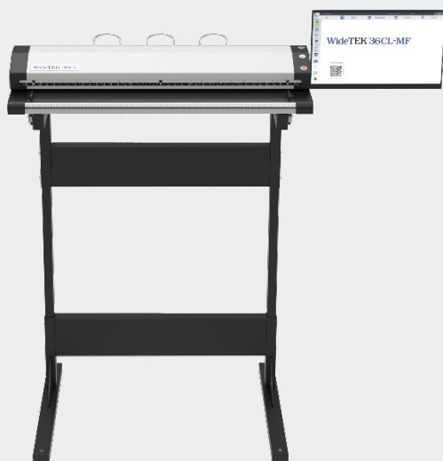
Very compact design

The WideTEK36CL-600-MF4 solution is by far the fastest color CIS scanner on the market, running at 10 inches per second at 200 dpi in full color. At the full width of 36" and at 600 dpi resolution, the scanner still runs at 1.7 inches per second. The scanning speeds are tripled in black and white and greyscale modes but can be individually configured if required; for example, to scan fragile or valuable documents.