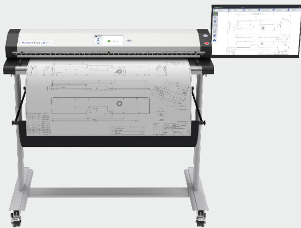
Large documents like maps rewind to the front or fall into the paper catch.

The WideTEK® 36CL produces extraordinarily sharp images, with color accuracy even superior to competing CCD scanners. Document rotation is done on the fly, a scan of an E-sized / A0 document in portrait mode at 300 dpi in 24bit color takes less than 7 seconds to scan and another 2 seconds to crop & deskew, preview and store.