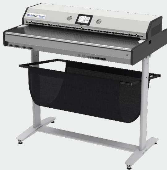
Side view of the WideTEK® 36DS with document collection basket. Scan stacks of newspaper pages without having to collect them each time they go through.

The scanner features two camera boxes, both consisting of three CCD systems, integrated into the upper and lower part of the device. WideTEK® 36DS captures both sides of the newspaper at the same time. After scanning, software separates the scanned document into four single images, capturing the left and right half of the front and back of the newspaper - everything in one single step.