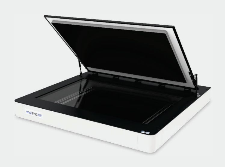
It can also be operated as a desktop model.