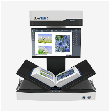
BookTEK® book scanners for bound materials up to A1+ format