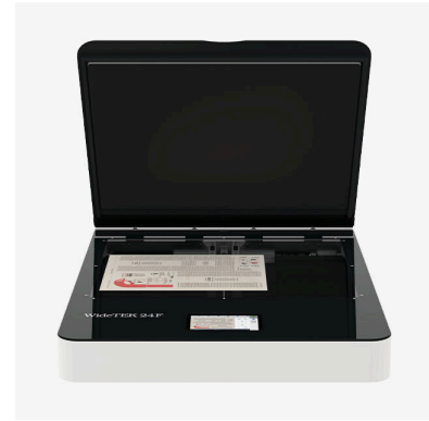
WideTEK® flatbed scanners for formats up to A1+ / 36" x 24"