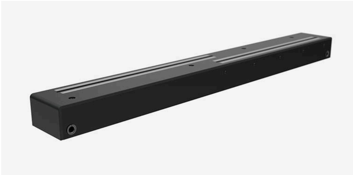
WideSCAN 24 Single Line Scan Bar

Whether it's quality control or fully automated inspection systems, WideSCAN Line Scan Bars deliver maximum precision, flexibility, and reliability for modern production workflows. More and more manufacturers are already integrating WideSCAN technology into their production equipment.