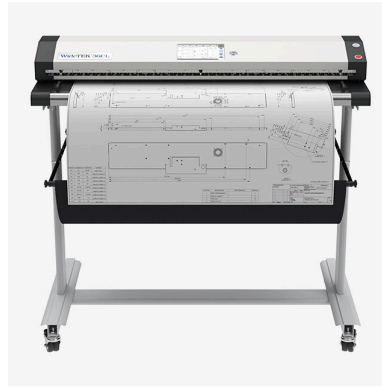
WideTEK® sheet-fed scanners for documents up to 60"