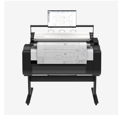
WideTEK® MFP solutions for seamless integration of large format scanning and printing