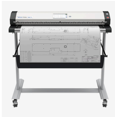
WideTEK® sheet-fed scanners for documents up to 60"