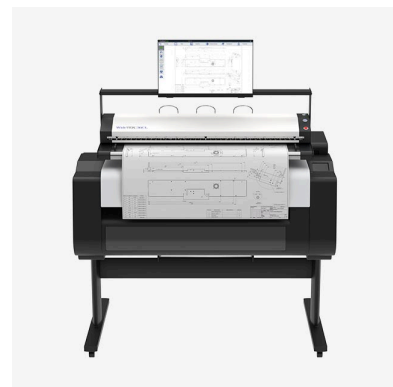
WideTEK® MFP solutions for seamless integration of large format scanning and printing