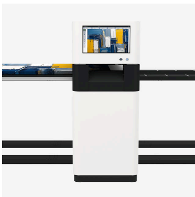
WideTEK® ART contact-free art scanners for formats up to 60" x 80"