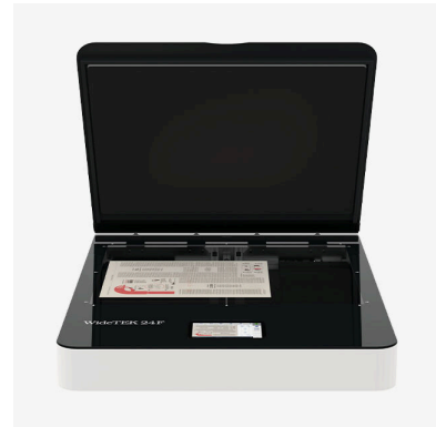
WideTEK® flatbed scanners for formats up to A1+ / 36" x 24"