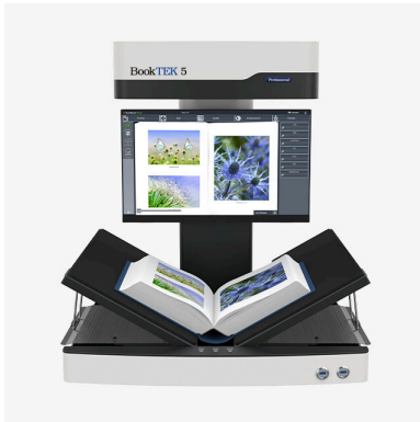
BookTEK® book scanners for bound materials up to A1+ format

Image Access is the technology leader in large-format scanning, offering solutions for all market segments. Our devices are designed and manufactured in Germany, representing the highest standards of quality.