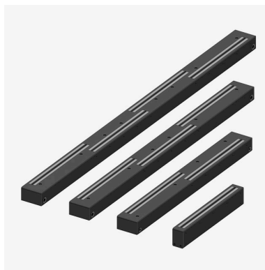
WideSCAN™ machine vision products for optimizing modern production processes