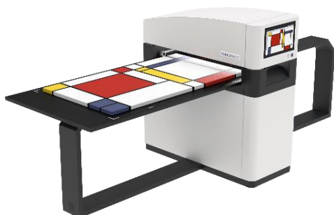
Fine art scanner WideTEK®36 ART