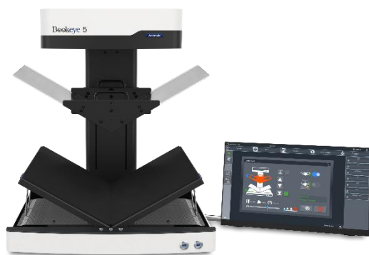
The new Bookeye 5 Automatic