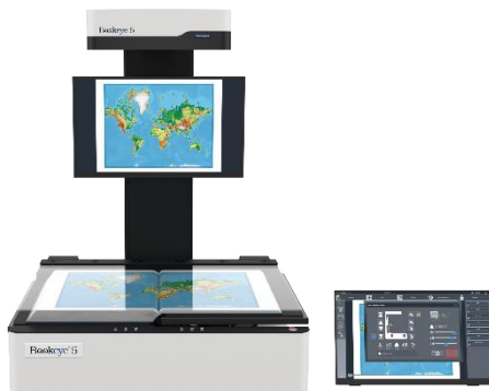
The new Bookeye 5 V1A