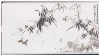
Ink drawing scanned on WideTEK® 36ART – see detail

If you are no longer interested in receiving our newsletter, you can unsubscribe by clicking here or send an information by our contact form . Previous editions of the newsletter can be found in our Newsletter Archive . If you have questions about our Privacy Policy or other questions about registration, please contact our Privacy Policy Controller at Dataprotection@imageaccess.de .