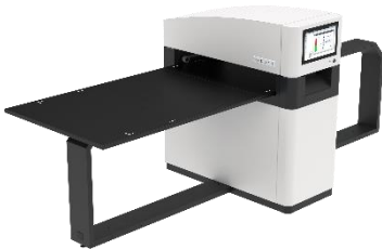
WideTEK® 36ART – Fine art scanner enables contact free scanning